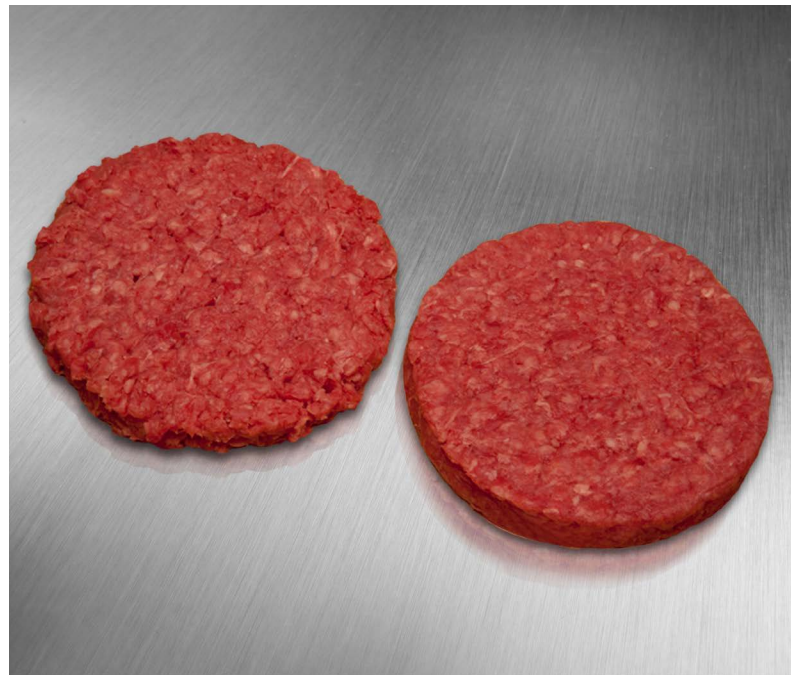
Proper temperature control is apparent in a cleaner release from forming equipment and in sharper edges of burgers, as shown at right