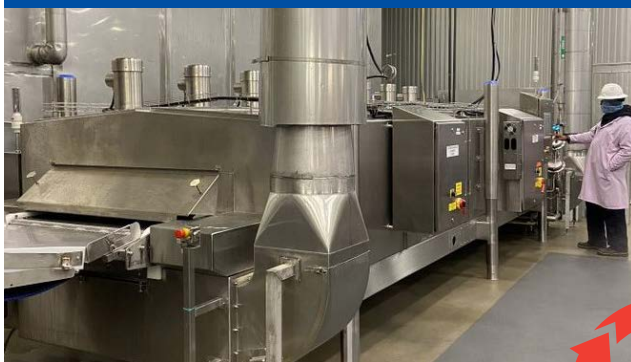
Make informed business decisions