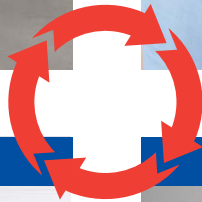
Improve Operational Control